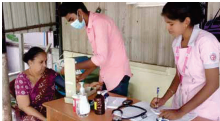
S & P Apartment, Vanagaram