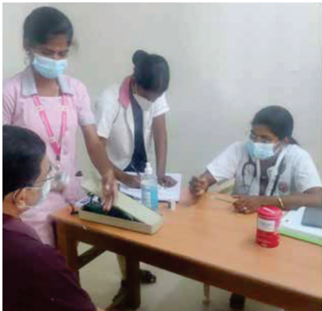
Yes Gee Yes Apartment, Vanagaram