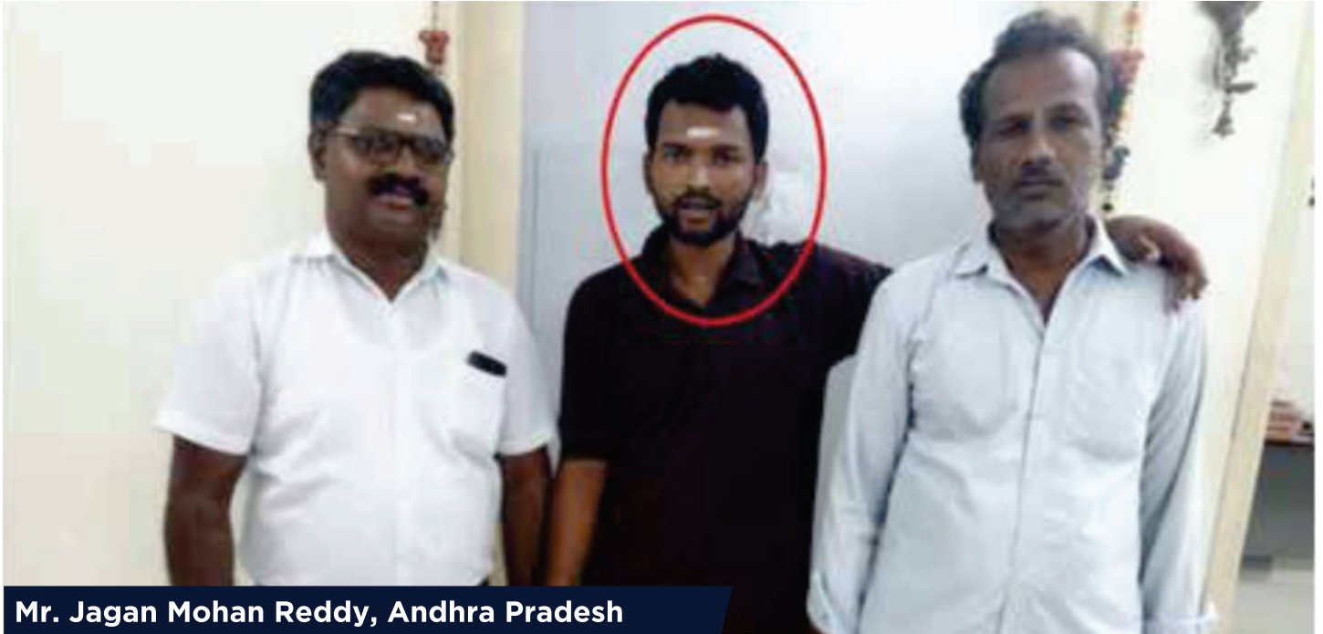
Mr. Jagan Mohan Reddy, Andhra Pradesh

An Andhra Pradesh native mentally ill found wandering on the street was rescued by Udavum Karangal.