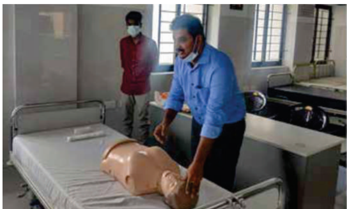
BLS Training for Ambulance Drivers