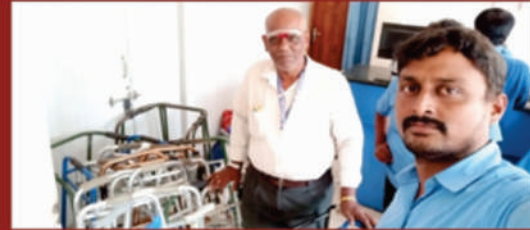
Mobility Aids donated to Putturkattu Bone & Joint Centre pvt.Ltd.