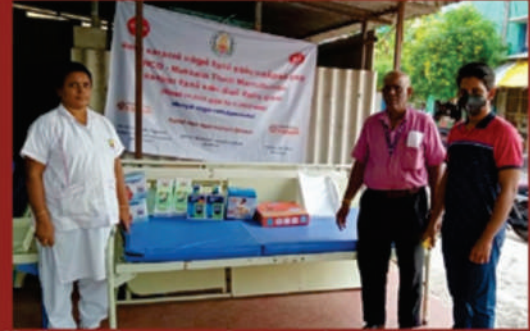
Medical equipments and accessories donated to Primary Health Centre Arani, Thiruvallur

Coimbatore – 99941 46610 ; Thiruvannamalai – 96000 78816 ; Madurai – 97910 15631